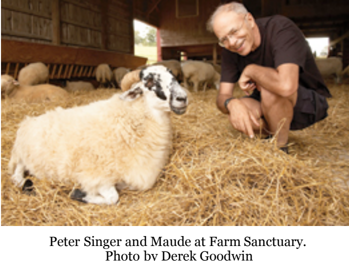
Peter Singer and Maude at Farm Sanctuary.

As a university student in the early 1970s, Peter Singer sat across from a friend who ordered a vegetarian meal. While eating meat, Singer asked his classmate why he didn't eat meat. His ethical reasons for vegetarianism prompted Singer to plumb some of the deepest moral issues of the time. He found factory farming indefensible and applied a utilitarian philosophical framework to a culture based on animal exploitation. Thus a book called Animal Liberation was born, published in 1975, which inspired an international movement.