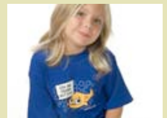
"Fish Are Friends, Not Food" T-Shirt