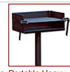
Wi-Fi Digital Photo Portable Heavy- Duty Park Grill