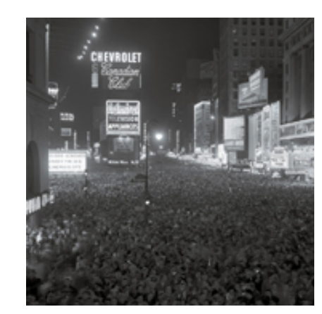
New Year's Eve, Times Square - 1954

The Times Square New Year's Eve Party welcoming in 1955 was the 50th anniversary of the first celebration at One Times Square.