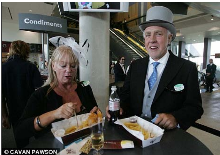
Race-goers indulge in some fast food at Ascot where meat is slaughtered in accordance with strict Islamic law

Huge choice, low prices - Find topdeals on Animal Cruelty now! www.Animal-Cruelty.best-deal.com