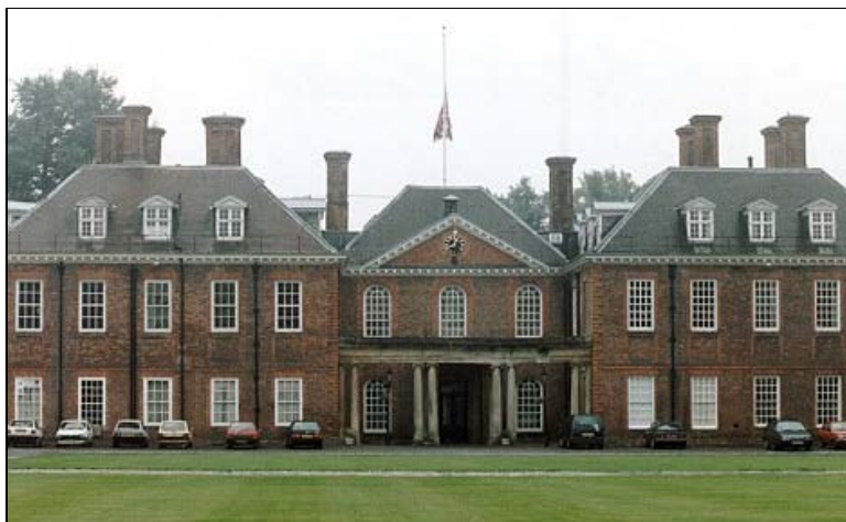
Marlborough College in Wiltshire has admitted that while halal chicken is usually only served to Muslims, it had 'occasionally' served it to all pupils

'It is not mentioned on any of our menus because we don't think there is customer demand for that information. But if people started asking, then we would definitely provide it.'