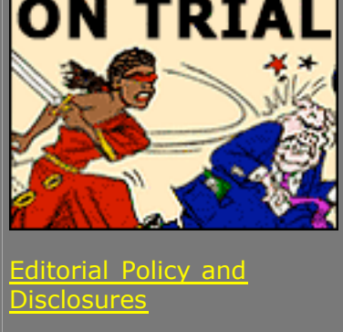
Site Design: Dan Feder

All contents, unless otherwise noted, © 2000-2009 Al Giordano