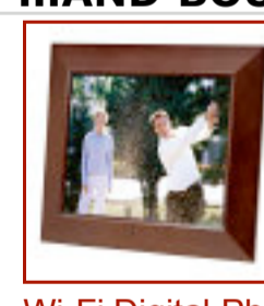
Wi-Fi Digital Photo Frame - 15in SamsClub.com