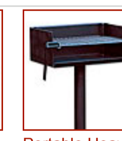
Portable Heavy-Duty Park Grill SamsClub.com