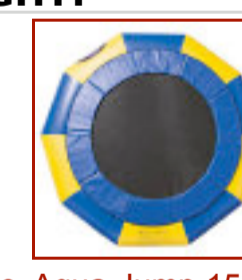
Aqua Jump 15 Water Trampoline w/ SI... SamsClub.com