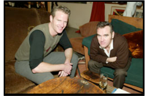
Drinking with Morrissey