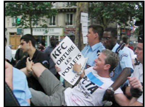
Protesting with PETA in Paris